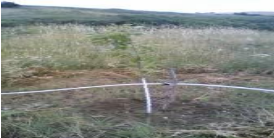
Note: Piping phase 06.07. 2019