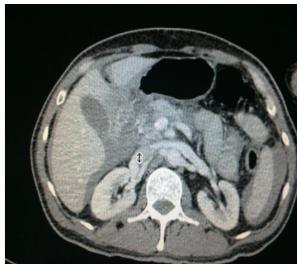
Figure 1. Gr.III transection of pancreatic head, free fluid in perihepatic space and in the omental bursa.

performed and revealed a total transection (class III according to Lucas classification) of the pancreatic head nearby the duodenum, free perihepatic fluid and in the omental bursa too.