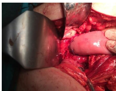
Figure 3. Roux-Y pancreatico-jejunostomy according to Houdart E.

The surgical procedure consisted in Roux-y pancreatico-jejunostomy, the pancreatic stump is invaginated into the jejunal loop according to Houdart E. The distal part of the pancreatic duct is closed by a ligature and it is performed a proper hemostasis of the remained pancreatic tissue nearby duodenal U. In the end, it is done peritoneal lavage and drainage. The 2 surgical drains are placed in omental bursa and Douglas pouch. The postoperative period was normal.