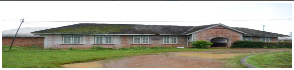
Figure 7: ENIEG Kumba Administrative Building