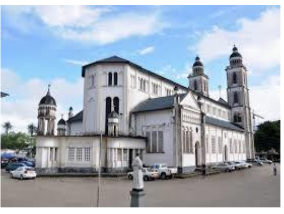
Figure 9: Cathedral of Saints Peter and Paul in Douala concsecrated in 1936.