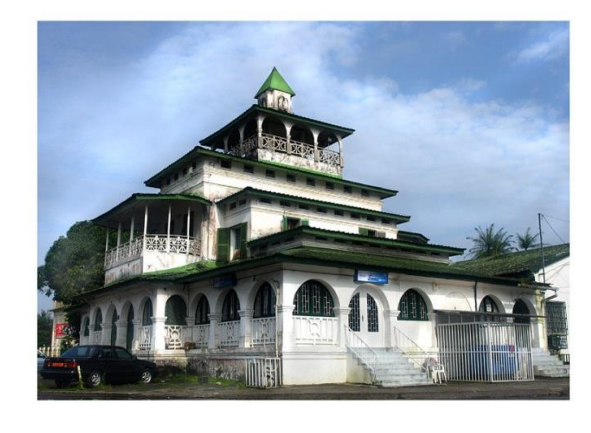
Figure 8: Palace of the Kings Bell, built by the Germans in 1905 for King Auguste Manga Ndumbe—Government square. in the administrative quarter. Bonanio. Douala.